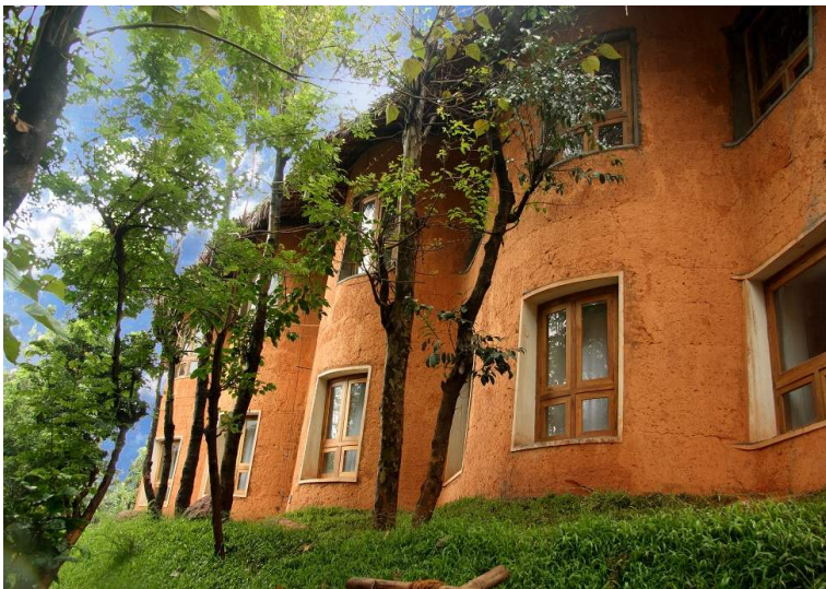
Banasura Hill Resorts

Located on the outskirts of the picturesque Thrikkaipetta village and surrounded by rice fields, Uravu Bamboo Grove is a defunct quarry re-designed by an Indian-Swiss architects collective called IN:CH. Constructed by locals, the innovatively-planned accommodations are built using environment-friendly materials like palm, bamboo and mud. This community-oriented retreat has eco-consciousness etched into its very heart. Besides using hyperlocally-sourced organic vegetables and solar energy wherever possible, sustainable practices at the resort also include rainwater harvesting, pineapple bio-fencing and waste segregation. "Tourism is only one aspect of what we do. We are heavily involved in community development (supporting 100 families) and employment generation via bamboo crafts," explains general manager Sivaraj Thekkayil. He adds that, beyond going on nature walks, tea tours or participating in low-energy cooking classes, their patrons are also encouraged to support these artisans who can literally 'make anything on request' by sourcing materials from their sustainable bamboo nursery, which boasts of over 40 different species. Bamboo cottages from `3,500 onwards. Details: wandertrails.com/experiential-stays