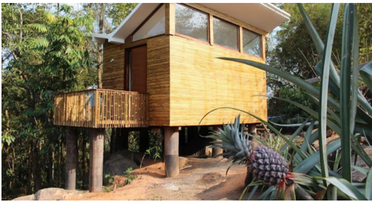
Uravu Bamboo Grove